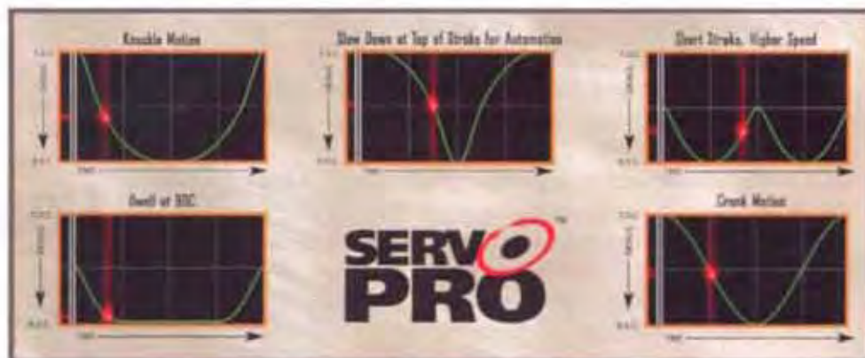
Figure 4 — Stampers can dial-in stroke, velocity and dwell profile for any job in an unlimited number of combinations—all on just one press.

Early generations of servo technology used high speed, low torque servo motors which were originally developed for the plastic injection molding industry. While suitable for embossing or blanking, the servo motor's limited torque and energy capability severely curtailed its use in forming applications. These restrictions made the servo motor impractical for normal presswork.