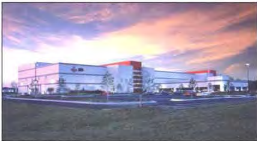
The AIDA plant in Dayton, Ohio— one of the world's most advanced press manufacturing facilities.

AIDA is a leading pioneer in the metalforming industry with over 85 years of innovation. Devoting five percent or more of its consolidated sales to research and development, AIDA continues to take strides that set it apart from other press builders. AIDA maintains a strong global presence