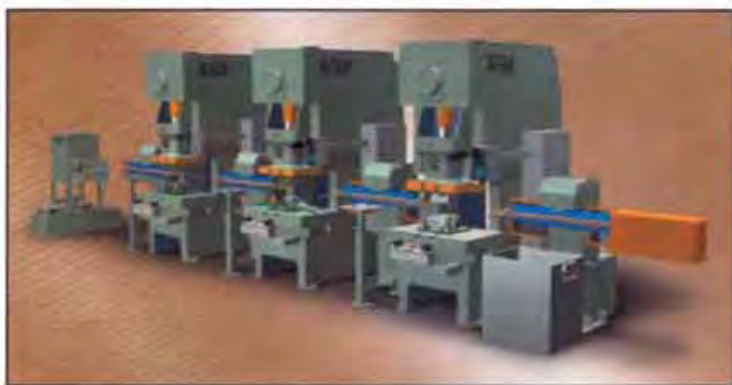
Figure 3 — ServoPro's complete programmability increases production and maximizes overall cycle time by allowing stampers to optimize each individual press operation in an automated application.

With ServoPro stampers have the ability to run a multi-press transfer line in continuous mode. See Figure 3 When compared to a conventional press line that operates in automatic single stroke mode, the ServoPro continuous mode can deliver productivity rates up to 50 percent higher. Specifically designed for general presswork, AIDA's ServoPro is equipped with a fully programmable slide motion and adjustable stroke length for an infinite number of combinations. These features make it possible for a stamper to turn one press into multiple machines – eliminating the need to purchase a variety of presses to perform different manufacturing processes.