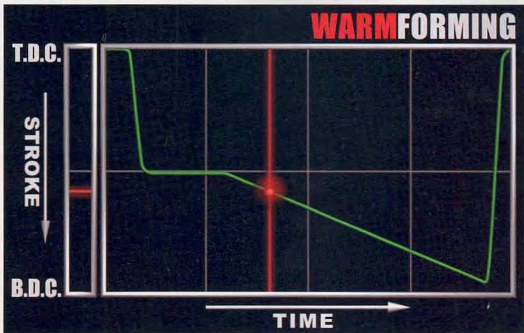
Figure 2—A graphical representation of the warm forming process on a servo-controlled press. The horizontal portion early in the stroke represents press dwell time. (T.D.C., Top Dead Center; B.D.C., Bottom Dead Center)

With these factors working together, the process has drawn