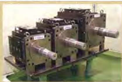
Figure 3—Servo motors used to control the press ram stroke.

At that temperature, though, high-temperature lubrication isn't all it's cracked up to be. "The heat caused all the lubricants to be very ineffective," Boerger explains. "One actually turned into a white powder that became very abrasive." So the team turned to a film that could withstand the high-temperature process. A hard insulation material was also used to protect press components from heat and to facilitate efficient heat transfer.