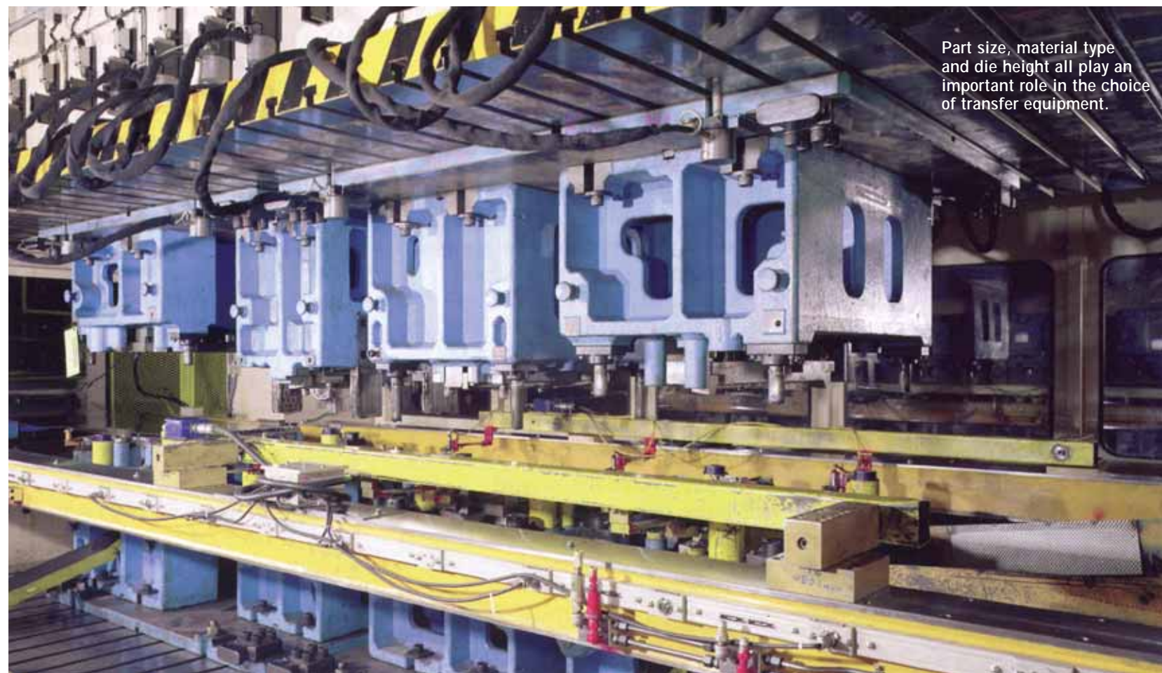
Part size, material type and die height all play an important role in the choice of transfer equipment.

When it comes to transfer presses, properly specifying the system upfront can mean the difference between profit-generating parts production and an inferior operation that drains bottom-line revenues. For stampers, the goal is to efficiently produce good parts.