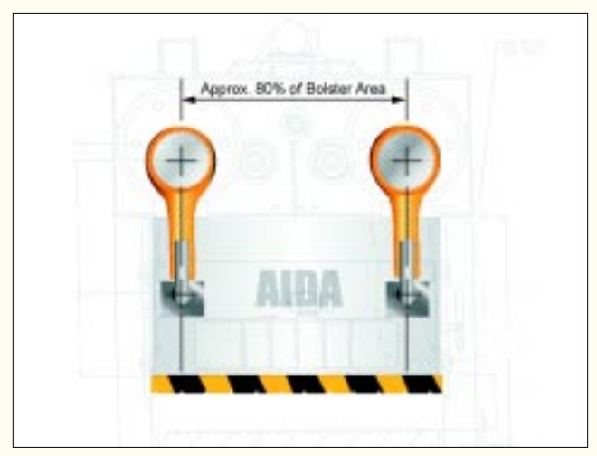
Caption: Wide spaced connections, approximately 30 percent farther apart than conventional presses, provides greater resistance to slide tipping caused by off center loads.

In response to these production challenges, AIDA is currently working with university partners to improve the formability of magnesium and other exotic metals through the introduction of a process that will allow the warm forming of sheet metal. The ability to introduce heat into a blank will allow manufacturers to accomplish forming operations that cannot be completed with conventional stamping processes.