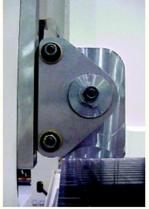
Caption: The NST's pre-loaded roller slide guides improve die life and part quality. The slide guide's lube free system also eliminates press oil in the die space.

developing next generation press technology. For AIDA, these four areas of activity allow the press builder to strike an important balance between developments that are revolutionary and those ongoing enhancements required for general stamping. As a technology leader, AIDA understands the importance of being able to support stamper's foundational needs while "mining" for technologically advanced options that will allow them to overcome the metalforming challenges of the future.