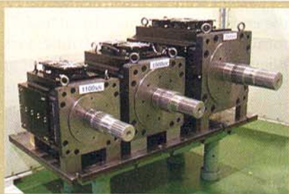
Figure 3—Servo motors used to control the press ram stroke.

At that temperature, though, high-temperature lubrication isn't all it's cracked up to be. "The heat caused all the lubricants to be very ineffective," Boerger explains. "One actually turned into a white powder that became very abrasive." So the team turned to a film that could withstand the high-temperature process. A hard insulation material was also used to protect press components from heat and to facilitate efficient heat transfer.