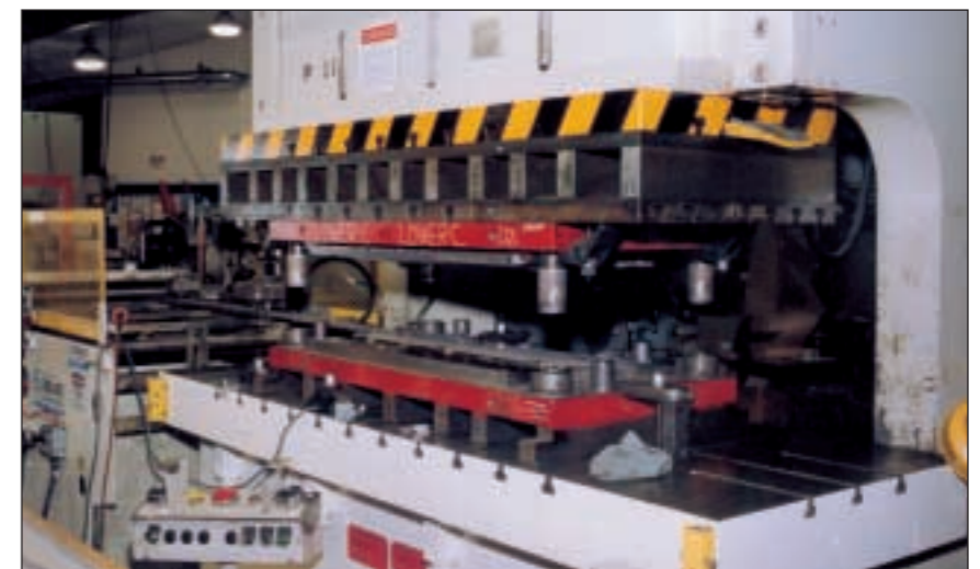
An example of a single-stroking operation where the blank is cut to length and its corners are trimmed. Then the blank is manually moved forward through two additional stations to complete the part.

Tenere tool makers found that during setup, Aida's micro inch design allowed them to slow flywheel speed and fine-tune tonnage requirements at any point in the stroke. "The ability to select micro inch for setup on the press allowed our toolmakers to actually see what was happening in the die by slowing the cycling speed of the press and literally inching the die in very small increments through a production