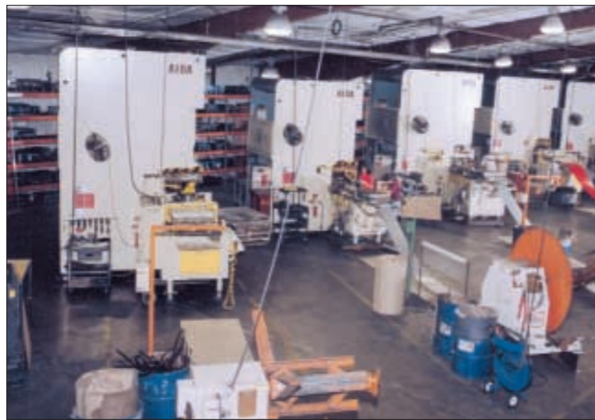
A portion of Tenere's line of automatically coil-fed Aida gap frame presses for use with progressive dies. Tenere Dresser has 17 presses ranging up to 275 tons capacity.

Contributing to Tenere's rapid growth is early supplier involvement in the customers' design and development processes, a practice that Tenere has followed since the early 1990s. Tenere's use of four technology and costing teams gives it the ability to respond quickly to customer needs.