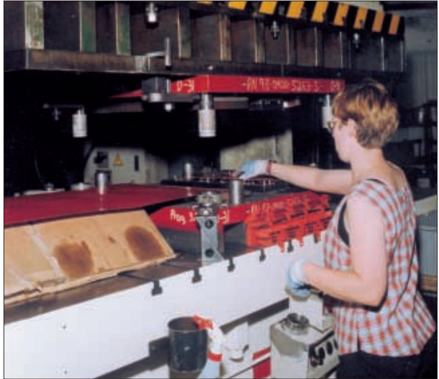
A coil-fed single stroking operation where a blank of prepainted material is produced in the first station, then manually transferred through two additional stations to complete the part.

“We know of a company that used an automatic transfer system, and within just six months the clutch had burned up,” Jensen said. “The only maintenance we perform on our Aida gap presses is to change the oil once a year. Since we’ve had