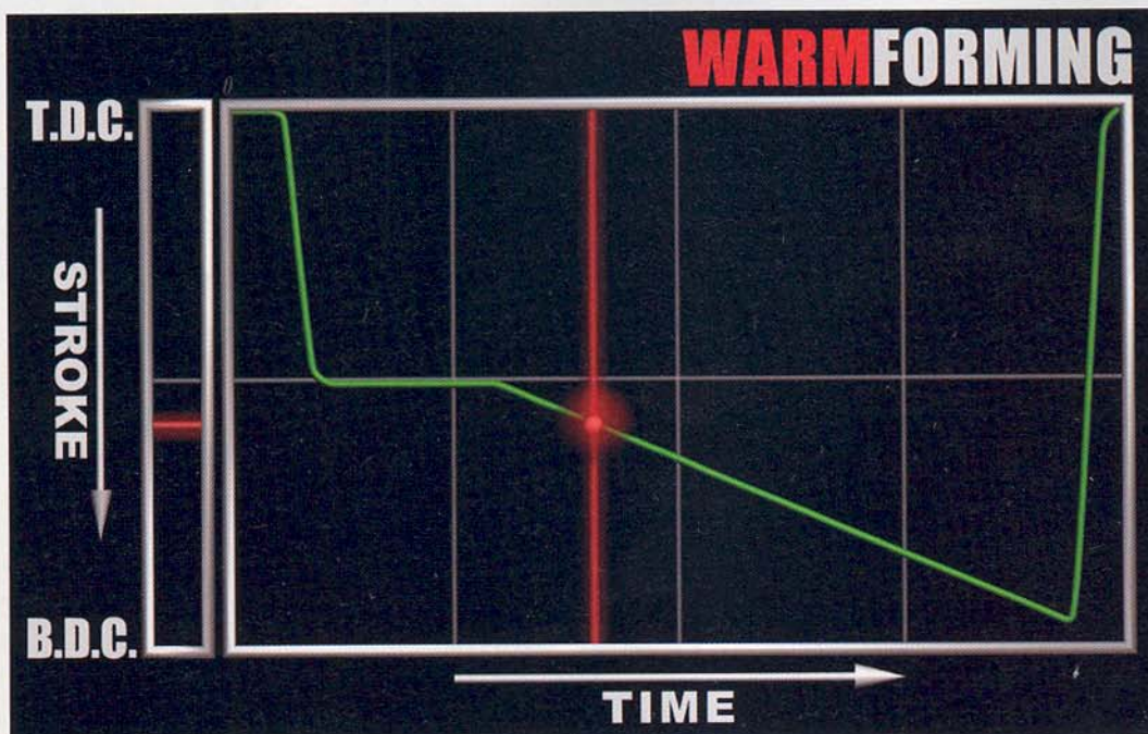
Figure 2—A graphical representation of the warm forming process on a servo-controlled press. The horizontal portion early in the stroke represents press dwell time. (T.D.C., Top Dead Center; B.D.C., Bottom Dead Center)

With these factors working together, the process has drawn