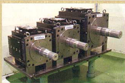
Figure 3—Servo motors used to control the press ram stroke.

At that temperature, though, high-temperature lubrication isn't all it's cracked up to be. "The heat caused all the lubricants to be very ineffective," Boerger explains. "One actually turned into a white powder that became very abrasive." So the team turned to a film that could withstand the high-temperature process. A hard insulation material was also used to protect press components from heat and to facilitate efficient heat transfer.